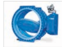
Ductile iron pipes, fittings and valves