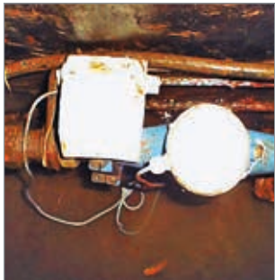
Smart water meter

Even in the age of digitalisation it is still important that the operators know exactly what their networks are doing. In future, they will be supported in their planning, construction and operation by digitally available data and information as well as digital products so that they can continue to guarantee a high degree of supply and disposal reliability into the future.