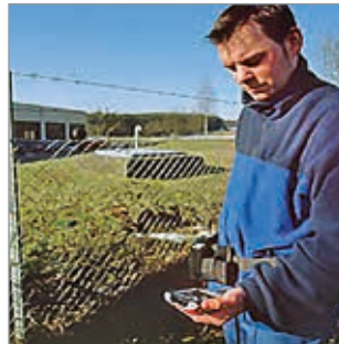
Using the App to read the meter

The digitalisation of the water industry offers new possibilities and challenges, particularly for the younger generation, the so-called digital natives, of getting involved in a working process which tends to be based on technical operations. In the light of the skills shortage which is already recognisable today, businesses engaged in the water industry should therefore start digitising their processes and thus gain a decisive advantage when it comes to recruiting motivated employees.