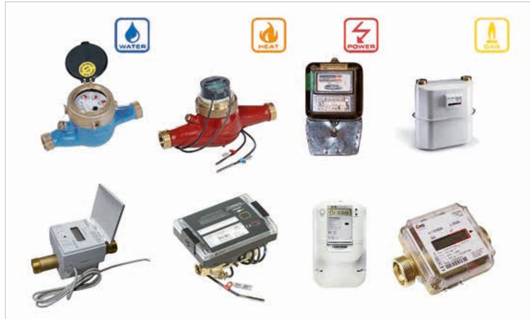
Classic and smart meters for various applications (left to right): water, heat, power and gas

These days there are water flow meters which offer outstanding measuring characteristics no matter where they are installed. This means that forward and backward volumes can be accurately assessed and leaks in home installations can be detected. The equipment has an internal power supply which ensures that the metering and communication tasks are carried out across at least two calibration periods. The installation of cryptographic chips in these metering devices meets the BSI standard, meaning that data transmission has the best possible safeguards against misuse.